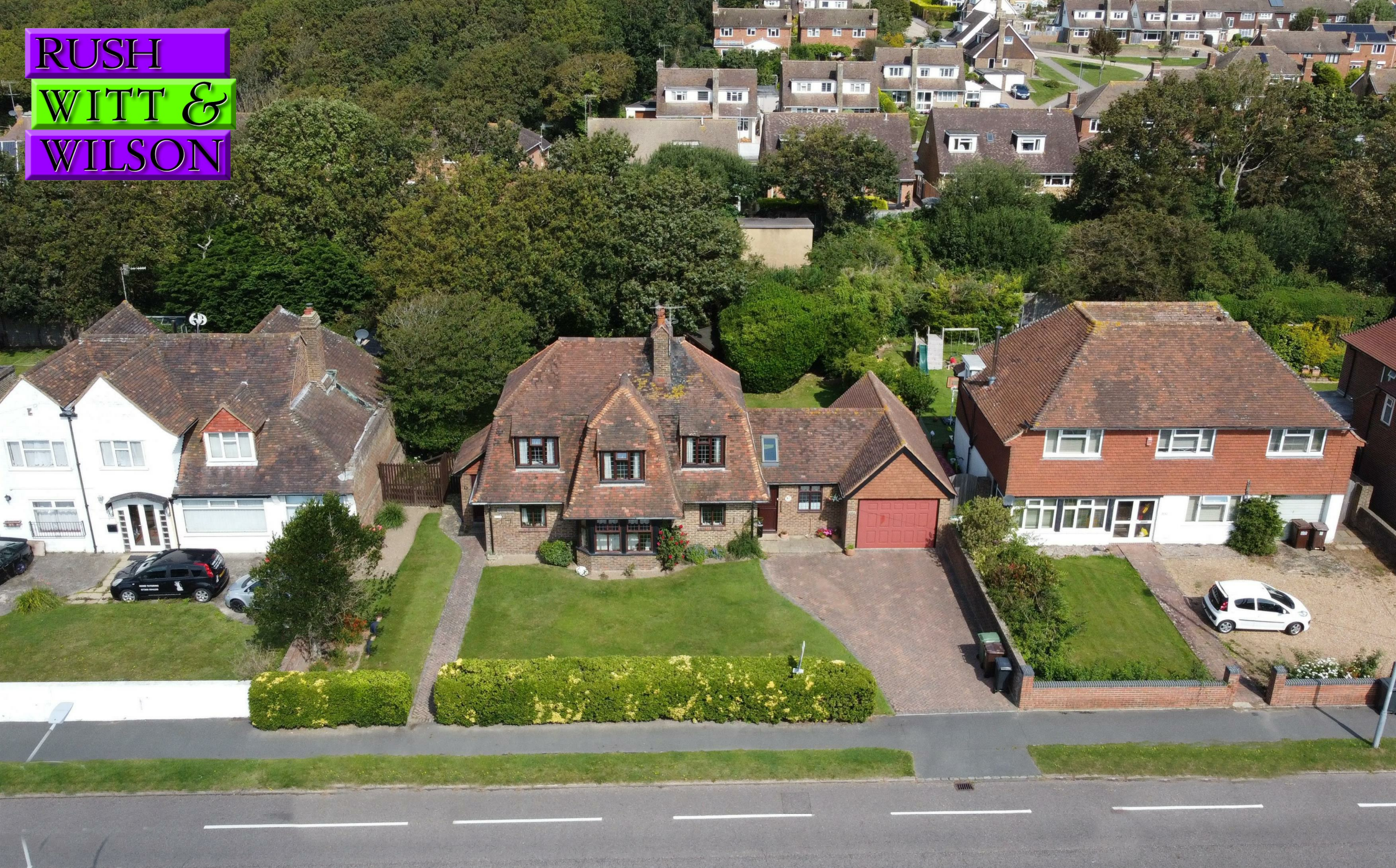
'Shambles' 202 Cooden Drive, Bexhill-On-Sea, East Sussex TN39 3AH £629,950